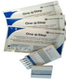
Fig.3 Multi-Drug Panel Test

Due to the sensitive nature of this drugs test, you must be careful when carrying out the test to avoid contamination and thus inaccurate test results. Please read these instructions carefully before beginning the test.