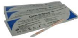
Fig.1 Single Drug Strip Test

This test is very accurate and the sensitivity levels meet the U.S.A. SAMHSA (Substance Abuse and Mental Health Services Administration) standards and recommended levels set by the National Institute on Drug Abuse (NIDA). There is however a possibility of false results due to the interference of other substances in the urine. One of the most common substances that causes false positives is Codeine , which is found in a variety of over-the-counter painkillers, including Nurofen Plus and Co-codamol. These products will give a positive result on an opiate / morphine test. It would be advisable to ask the person being tested if they are on any prescription drugs for medical purposes before the test is carried out.