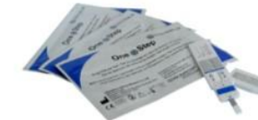
Fig.2 Single Drug Panel Test