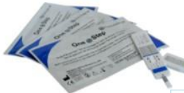
Fig.2 Single Drug Panel Test