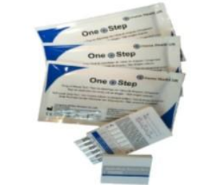
Fig.3 Multi-Drug Panel Test

Due to the sensitive nature of this drugs test, you must be careful when carrying out the test to avoid contamination and thus inaccurate test results. Please read these instructions carefully before beginning the test.