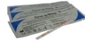
Fig.1 Single Drug Strip Test

This test is very accurate and the sensitivity levels meet the U.S.A. SAMHSA (Substance Abuse and Mental Health Services Administration) standards and recommended levels set by the National Institute on Drug Abuse (NIDA). There is however a possibility of false results due to the interference of other substances in the urine. One of the most common substances that causes false positives is Codeine , which is found in a variety of over-the-counter painkillers, including Nurofen Plus and Co-codamol. These products will give a positive result on an opiate / morphine test. It would be advisable to ask the person being tested if they are on any prescription drugs for medical purposes before the test is carried out.