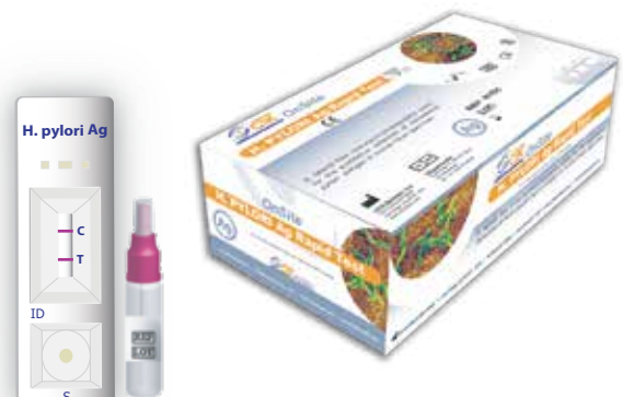
OnSite H. pylori Ag Rapid Test